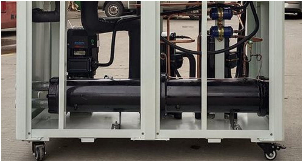
Shell and tube Condenser for water-cooled Laminating chiller

The condenser for water-cooled Laminating cooler is shell and tube ,with the internal copper tubes employing an outer thread embossing process.This design effectively enhances the heat exchange efficiency between the refrigerant and water during the process. Compared to traditional smooth copper tubes, the outer thread embossing process increases the surface area of the copper tubes, thereby expanding the contact area for heat exchange and improving the thermal conductivity of the condenser. This optimization design allows the condenser of the water-cooled chiller to transfer heat from the refrigerant to the water more rapidly and consistently, enabling the water to carry away the heat.