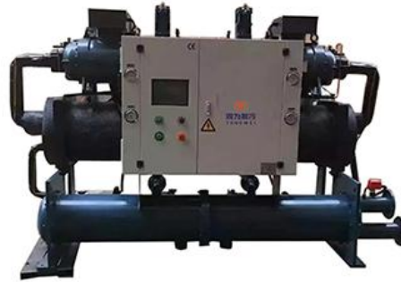
Water-cooled Laminating Screw Chiller