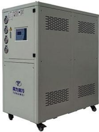
Water-cooled Laminating Scroll Chiller