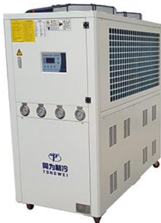
Air-cooled Laminating Scroll Chiller