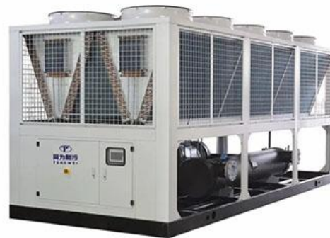
Air-cooled Laminating Screw Chiller